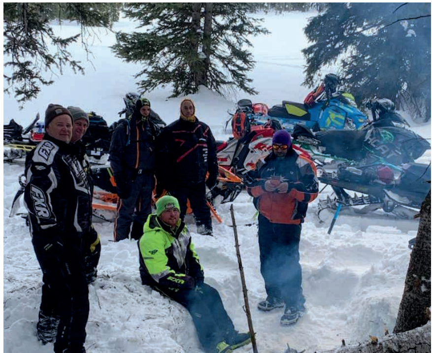
Watertown’s South Dakota Snowmobile Club members take a break during an outing.

More information on the state’s snowmobile clubs can be found at the SDSA’s website at snowmobilesd.com .