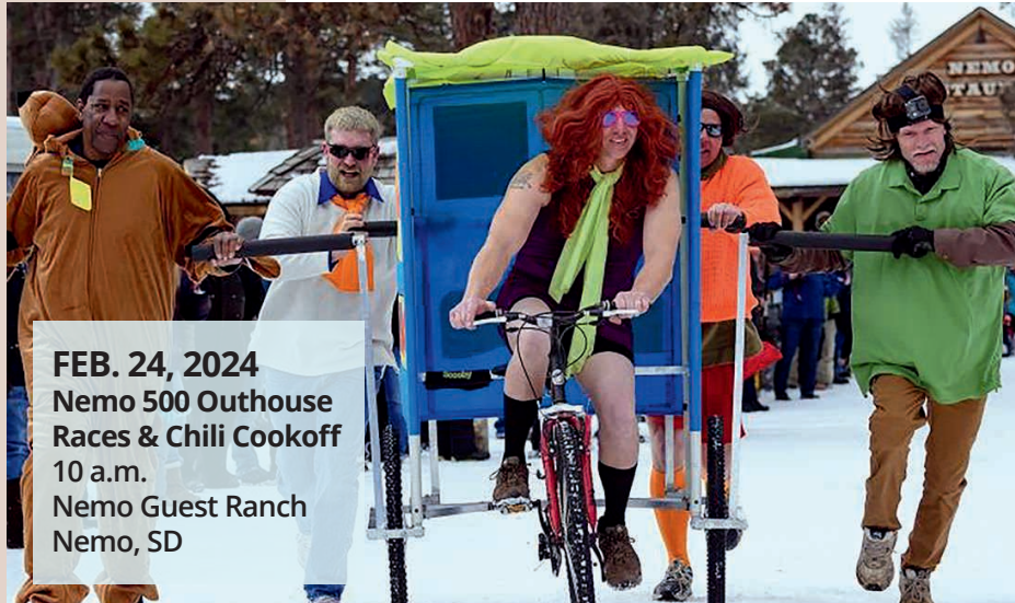
FEB. 24, 2024 Nemo 500 Outhouse Races & Chili Cookoff 10 a.m. Nemo Guest Ranch Nemo, SD

To have your event listed on this page, send complete information, including date, event, place and contact to your local electric cooperative. Include your name, address and daytime telephone number. Information must be submitted at least eight weeks prior to your event. Please call ahead to confirm date, time and location of event.