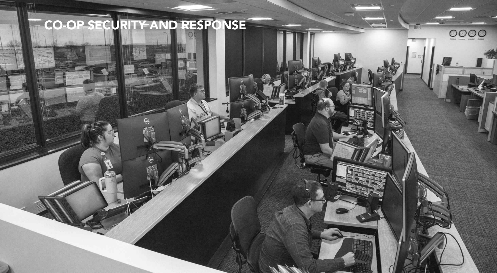
Basin Electric Security and Response Services dispatchers take calls from rural electric cooperative members at Basin's headquarters in Bismarck, N.D.