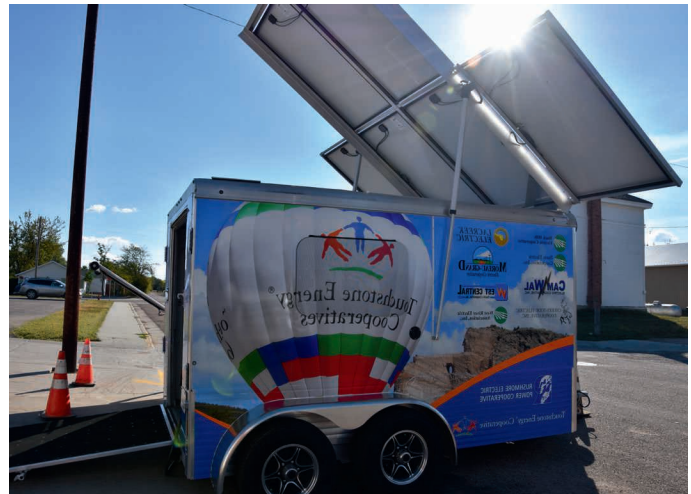
The solar trailer has been featured at several co-op public outreach events.