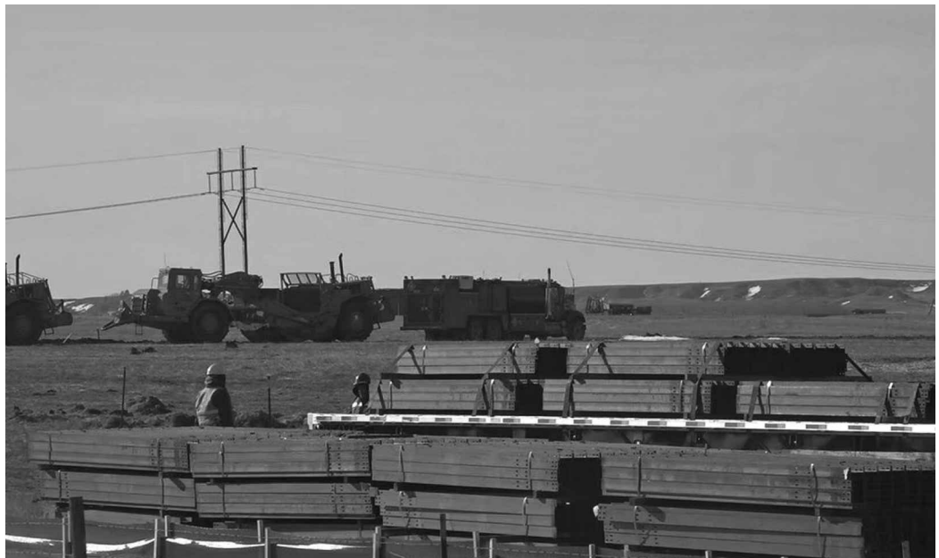
Construction began earlier this year on a large solar farm near New Underwood in Pennington County. Some of the power will be purchased by Basin Electric and be distributed to cooperatives in South Dakota.

The Clark County wind farm uses 77 turbines to create 200 megawatts of power, the National Grid Renewables representative said. It began operation in 2019 and employs 10 people.