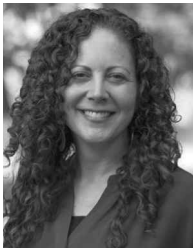
Miranda Boutelle Efficiency Services Group

Open the door to energy savings by improving the efficiency of your exterior doors – without compromising the aesthetics of your home.