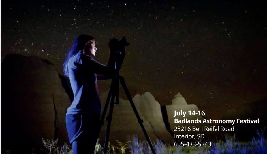
July 14-16 Badlands Astronomy Festival 25216 Ben Reifel Road Interior, SD 605-433-5243

To have your event listed on this page, send complete information, including date, event, place and contact to your local electric cooperative. Include your name, address and daytime telephone number. Information must be submitted at least eight weeks prior to your event. Please call ahead to confirm date, time and location of event.