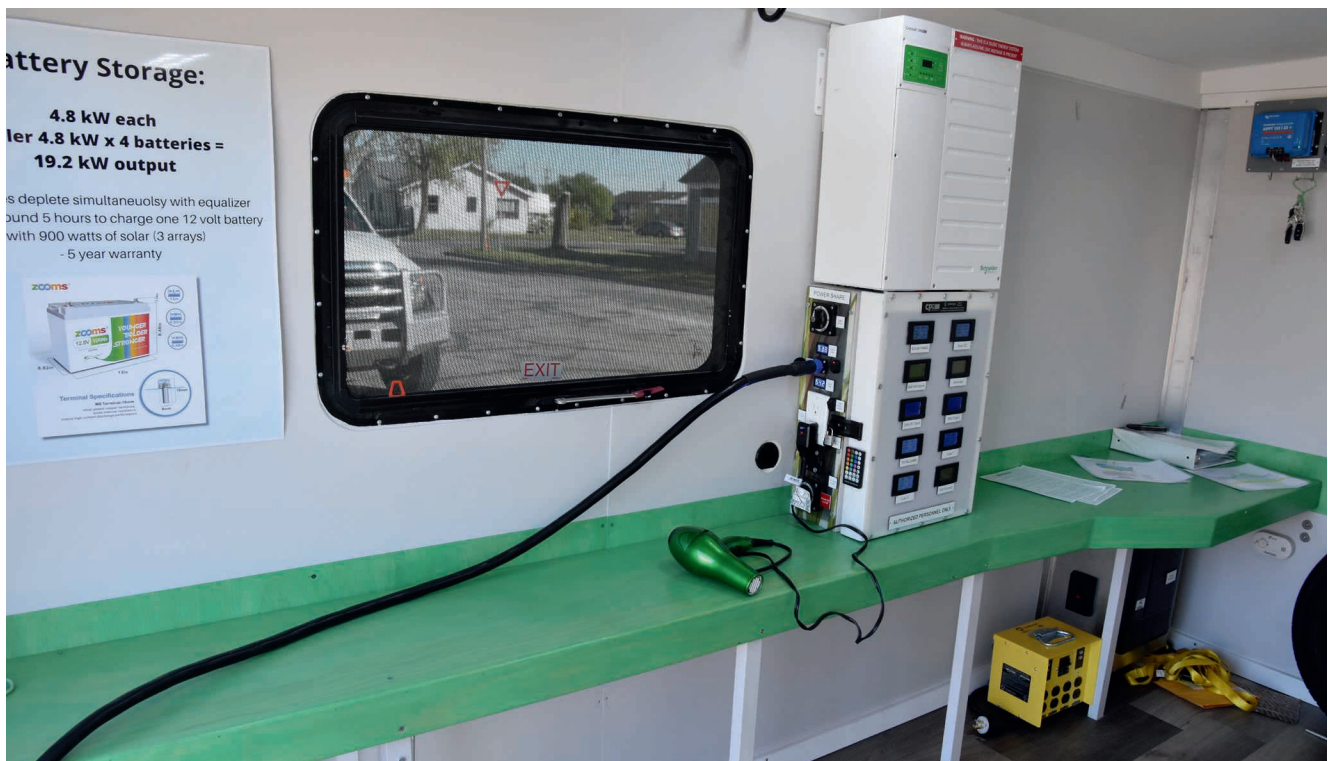
The interior of the solar trailer is equipped with battery storage and outlets – powering everyday electrical appliances, such as a hairdryer.

The landscape of renewable energy is vast and ever-changing and every co-op is planning their own approach, but with resources like the solar trailer, tools for education and engagement are within reach for members wanting to learn more.