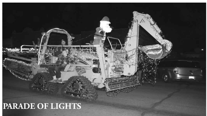
PARADE OF LIGHTS