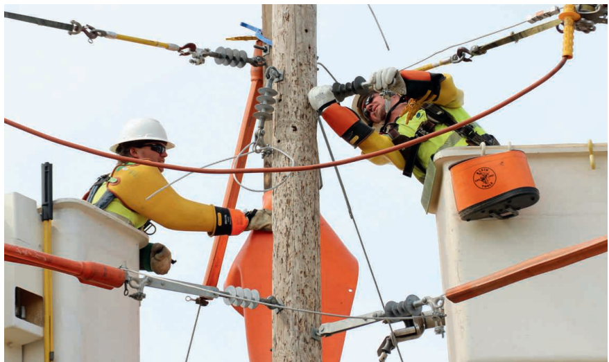
MTC is a prime training ground for future co-op linemen.

For more information about MTC, visit www.mitchelltech.edu .