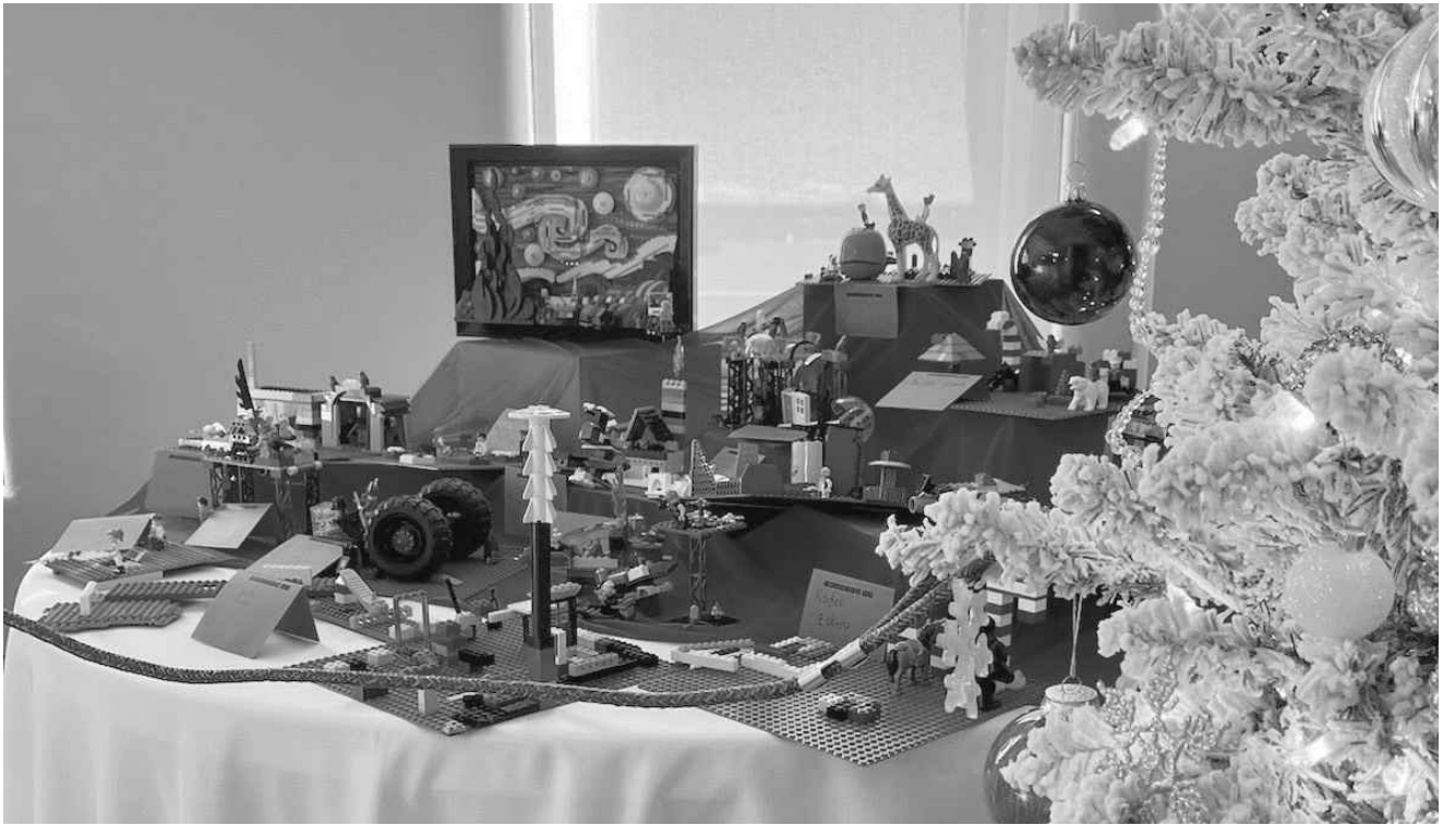
This display was created by the local Lego club and attracted a lot of interest during the Christmas season.