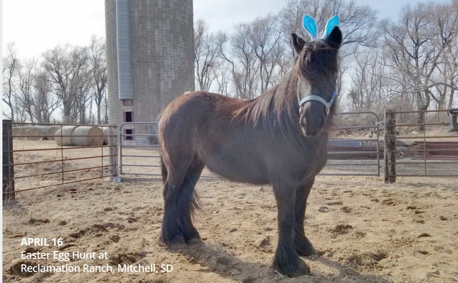
APRIL 16 Easter Egg Hunt at Reclamation Ranch, Mitchell, SD

To have your event listed on this page, send complete information, including date, event, place and contact to your local electric cooperative. Include your name, address and daytime telephone number. Information must be submitted at least eight weeks prior to your event. Please call ahead to confirm date, time and location of event.